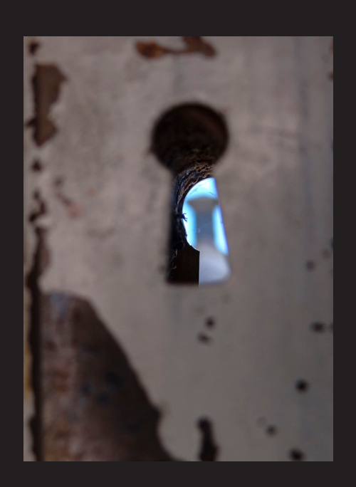
Digitally Daring Photography